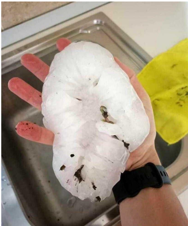
Record breaking hailstone in Italy