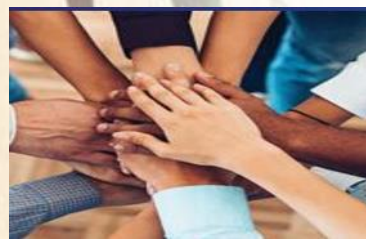
Grow with Collaboration

International Forum of Meteorological Societies uniting National Hydromet Societies